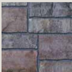
Lueders Gray Rustic Beige