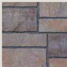
Waco Natural Rustic Beige