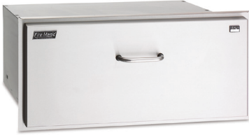
MASONRY DRAWER MODEL: 13-31-SSD CUT-OUT: 13" x 31" x 20 1/2"