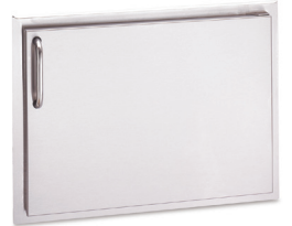
SINGLE ACCESS DOOR* MODEL: 17-24-SSDR OR DL CUT-OUT: 18" x 24 1/2"