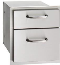
DOUBLE DRAWER MODEL: 16-15-DSSD CUT-OUT: 15 3/4" x 14 1/2" x 20 1/2"