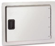
SINGLE ACCESS DOOR MODEL: 17-24-SD CUT-OUT: 17 1/2" x 24 1/2"