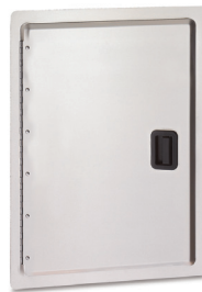
SINGLE ACCESS DOOR MODEL: 20-14-SD CUT-OUT: 20 1/2" x 14 1/2"