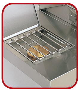
FLUSH MOUNTED SIDEBURNER