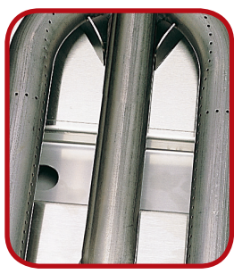
STAINLESS STEEL BURNERS