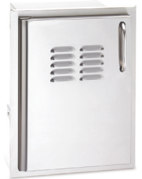
SINGLE ACCESS DOOR WITH TANK TRAY AND LOUVERS* MODEL: 20-14-SSDLV OR DRV CUT-OUT: 21" x 14 1/2" x 20 1/2"