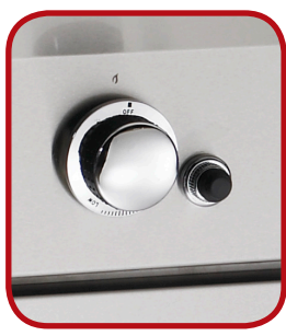
PUSH BUTTON ELECTRONIC IGNITION