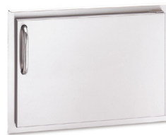
SINGLE ACCESS DOOR* MODEL: 14-20-SSDR OR DL CUT-OUT: 15" x 20 1/2"