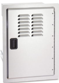
SINGLE ACCESS DOOR (RIGHT OR LEFT) WITH TANK TRAY AND LOUVERS MODEL: 20-14-SDV CUT-OUT: 20 1/2" x 14 1/2" x 20 1/2"