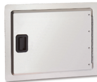
SINGLE ACCESS DOOR MODEL: 14-20-SD CUT-OUT: 17 1/2" x 24 1/2"