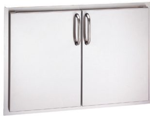
DOUBLE ACCESS DOORS MODEL: 20-30-SSD CUT-OUT: 21" x 30"