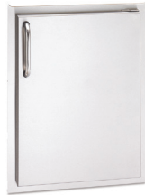
SINGLE ACCESS DOOR* MODEL: 20-14-SSDR OR DL CUT-OUT: 21" x 14 1/2"