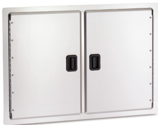
DOUBLE ACCESS DOOR MODEL: 20-30-SD CUT-OUT: 20 1/2" x 30"