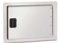
SINGLE ACCESS DOOR MODEL: 12-18-SD CUT-OUT: 17 1/2" x 24 1/2"