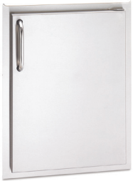
SINGLE ACCESS DOOR* MODEL: 24-17-SSDR OR DL CUT-OUT: 21" x 14 1/2"